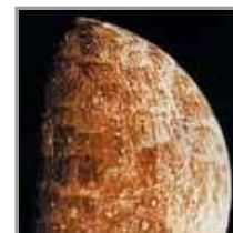
Mercury's battered surface.